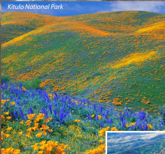
Kitulo National Park